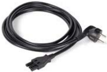
WIELAND CONNECTION CABLE