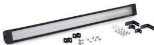
LAMP W=988 MM WITH BRACKETS FOR FASTENING