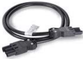
WIELAND CONNECTION CABLE WITH IN/OUT PLUGS