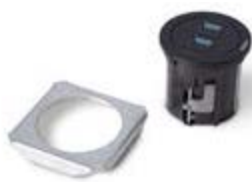
USB DATA PORT