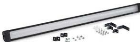
LAMP W=1473 MM WITH BRACKETS FOR FASTENING