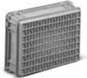
Detail of reinforced bottom

Stacking container with perforated bottom Order no. F PA 4051 EO 01 External dimensions: mm 400x300x120h Useful internal dimensions: mm 355x255x100h Weight: 840 gr Capacity: 10 litres