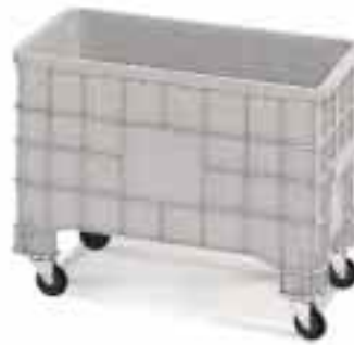
Order no. F PT 1140 00 01 with wheels Ø 100 mm Order no. F PT 1240 00 01 with wheels Ø 125 mm