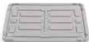
Order no. F PT 7040 00 01 for order no. F PT 1140 00 01 - F PT 1240 00 01