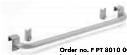
Order no. F PT 8010 00 01 for order no. F PT 1140 00 01 - F PT 1240 00 01 Order no. F PT 8020 00 01 for order no. F PT 3140 00 01 - F PT 3240 00 01