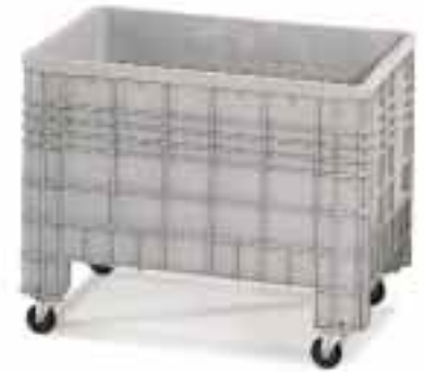
Order no. F PT 3140 00 01 with wheels Ø 100 mm Order no. F PT 3240 00 01 with wheels Ø 125 mm