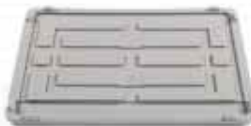
Order no. F PT 7540 00 01 for order no. F PT 3140 00 01 - F PT 3240 00 01

The plastic containers can be closed with special polyethylene lids.