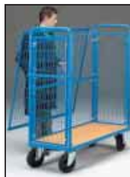
3/4. The removable side can be attached to the rear mesh with the two hooks.