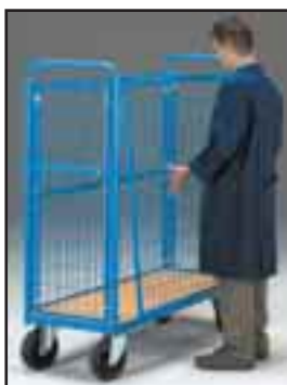
2. After it is opened, the removable side can be removed by lowering it.