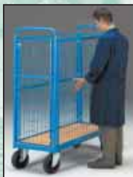
1. The removable mesh side is quick and easy to open as shown in the three photos on the left.