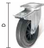
WHEEL STEEL PLATE, BIG