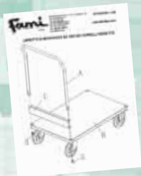
All trolleys are supplied with the instructions handbook

1 The uprights feature holes with 26 mm increments for optimising the position and tilting angle of the shelves.