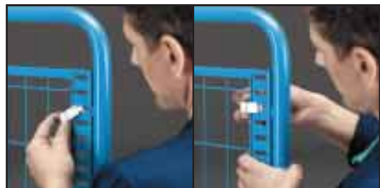
detail of assembly...