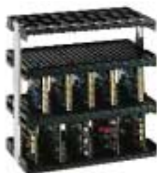
frame in a horizontal position