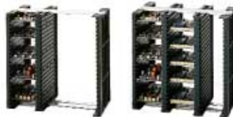
frame in a vertical position