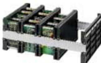
frame in a flat position