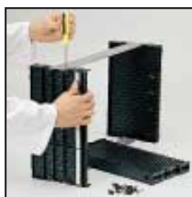
fitting the frame