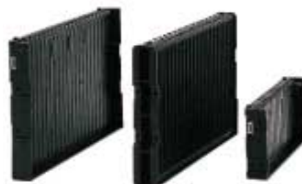
Art. F PV 6452 00 07 Side frames Art. F PV 6852 00 07 Central frames Art. F PV 6252 00 07 Side frames