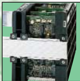
details of fastener