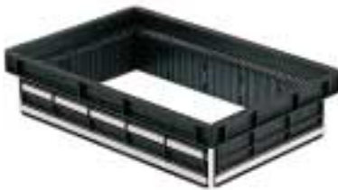
MEGAPRINT® 600x300 Art. F PV 8952 00 07