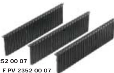
F PV 2252 00 07 F PV 2352 00 07 F PV 2452 00 07