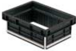
MEGAPRINT® 400x300 Art. F PV 8752 00 07