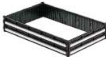
MINIPRINT® 600x300 Art. F PV 8452 00 07