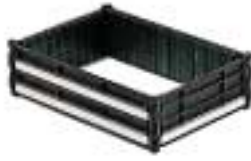
MINIPRINT® 400x300 Art. F PV 8252 00 07