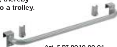
Art. F PT 8010 00 01 for art. F PT 1140 00 01 - F PT 1240 00 01 Art. F PT 8020 00 01 for art. F PT 3140 00 01 - F PT 3240 00 01

A practical handle can be fitted with two fit-and-screw supports to make manual transport easier, thereby turning the container into a trolley.