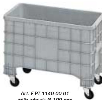
Art. F PT 1140 00 01 with wheels Ø 100 mm Art. F PT 1240 00 01 with wheels Ø 125 mm