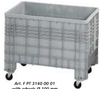
Art. F PT 3140 00 01 with wheels Ø 100 mm Art. F PT 3240 00 01 with wheels Ø 125 mm