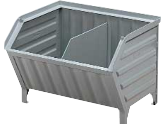
A divider fitted into a container Art. F ML 0510 00 ..

Art. F ML 0710 00 01 Art. F ML 0710 00 99 for Art. F ML 0510 00 .. Overall dimensions: mm 630/460x405h