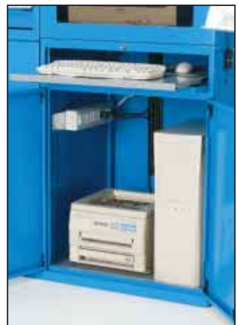
can contain big towers