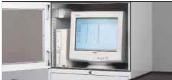
Computer cabinets order no. F AS 0801 11 08