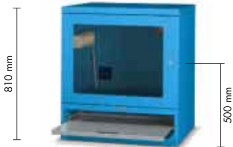
Dim. 717x635x810 mm h. Complete with: 1 height-adjustable shelf, 1 retractable keyboard shelf.