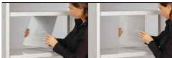
Assembling a shelf panel

The shelf panels are fitted into the slots between two shelves. They are available galvanised and in various heights ranging from 165 to 415 mm and in 5 different depths.