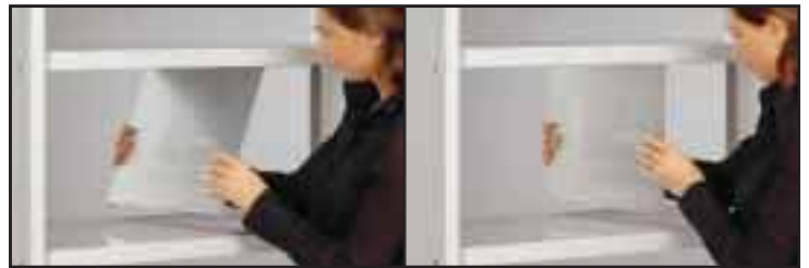
Assembling a shelf panel

The shelf panels are fitted into the slots between two shelves. They are available galvanised and in various heights ranging from 165 to 415 mm and in 5 different depths.