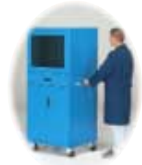
Transport on wheels