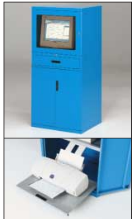
can contain large printers