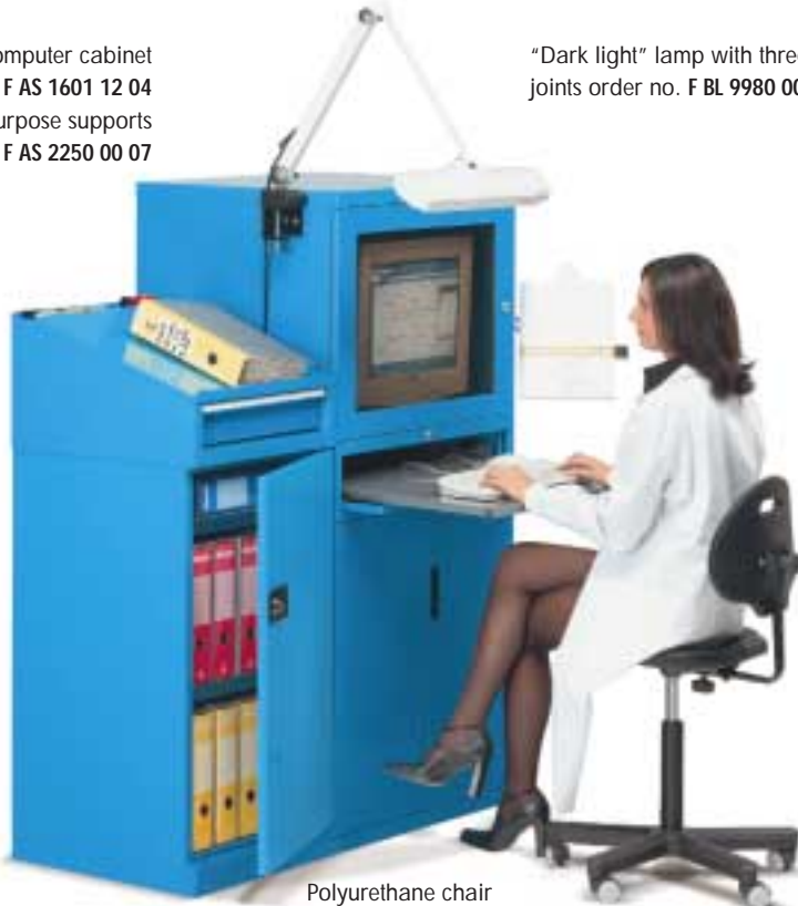
Cabinet with writing desk order no. F AA 0110 00 04

"Dark light" lamp with three joints order no. F BL 9980 00 08