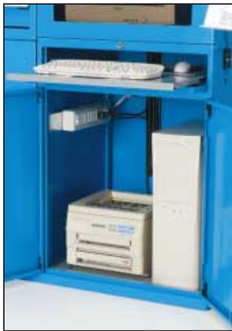
can contain big towers

Cabinets must be fixed to the wall or to the floor.