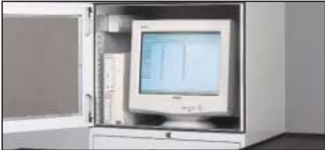
Computer cabinets order no. F AS 0801 11 08