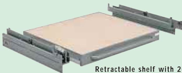
Retractable shelf with 20 H mm upstand on all 4 sides, fitted with Multiplex wood cover 12 mm thick