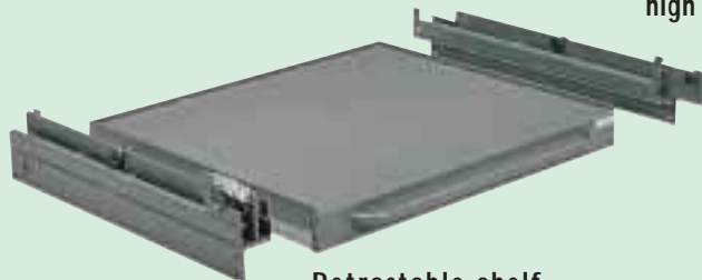
Retractable shelf with 20 H mm upstand on 3 sides

Made from high quality sheet steel. The shelves are folded and additional supports are welded to the shelves to achieve maximum strength. The telescopic guide rails are made from re-inforced steel to increase the steel strength by 20 percent. Each pair of telescopic guide rails is fitted with 14 off high performance steel roller bearings and 12 supporting roller bearings. The guide rails are bolted to the uprights and are adjustable in increments of 50 mm. Max. load capacity 1000 kg evenly distributed weight.