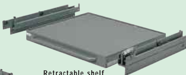
Retractable shelf with 20 H mm upstand on all 4 sides